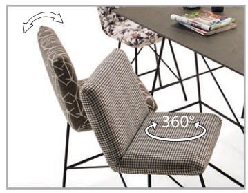
Rotation function (360°) and individual back adjustment