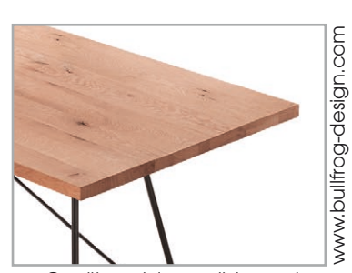
Quality outdoor solid wood in different wood variants or concrete table top