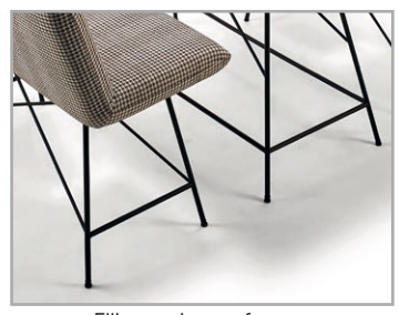
Filigree base frame, metal, powder-coated fine structure in black matt