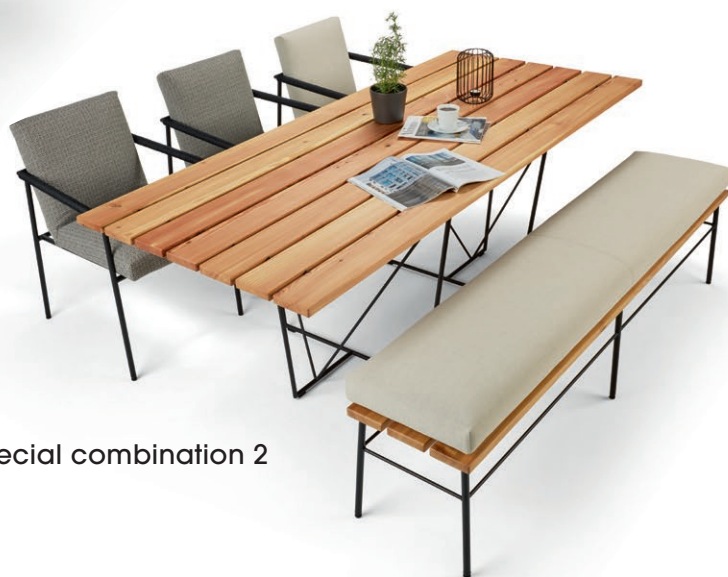
Special combination 2