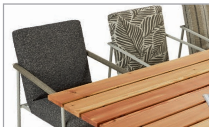
Optional metal base frame with or without wrapped armrest