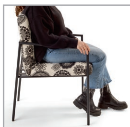
Loosely inserted seat cushion offers an individual sitting comfort