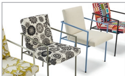
Base frame optionally available in 4 colours