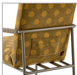
Optionally hotfrog: heatable chair cushion