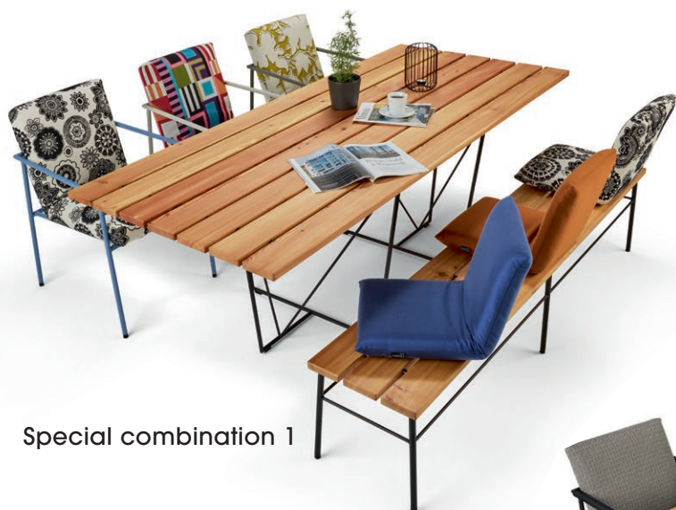
Special combination 1