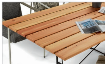
Choice of different outdoor woods