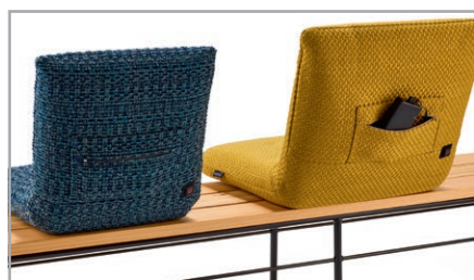
Optionally functional cushion or heatable functional cushion - hotfrog (Powerbank not included in scope of delivery)