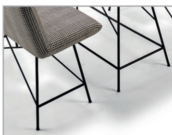
Filigree base frame, metal, powder-coated fine structure in black matt