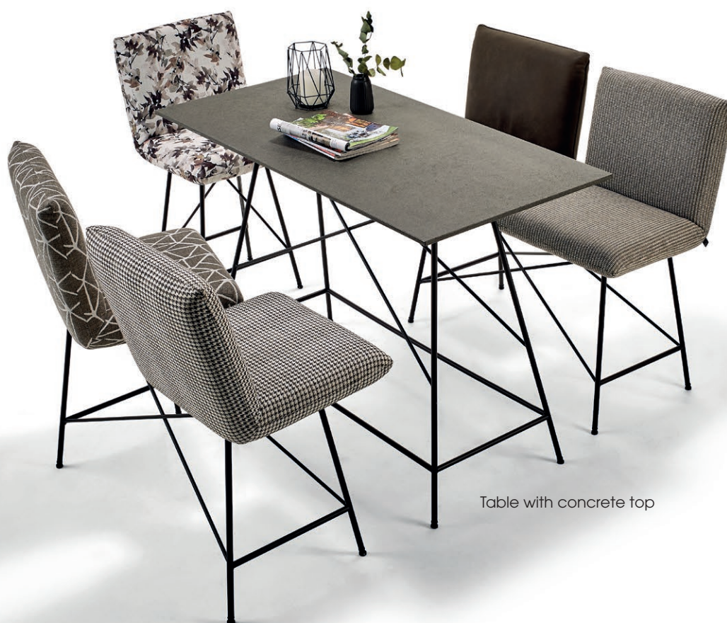
Table with concrete top