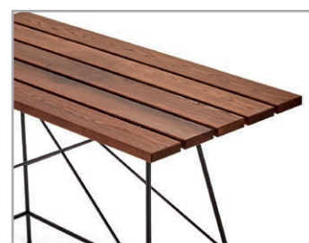
Quality outdoor solid wood in different wood variants or concrete table top