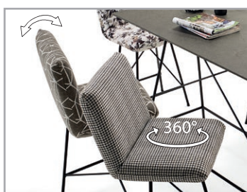
Rotation function (360°) and individual back adjustment