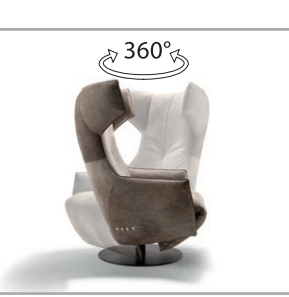
360° rotary function