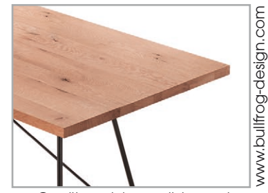
Quality outdoor solid wood in different wood variants or concrete table top