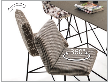
Rotation function (360°) and individual back adjustment