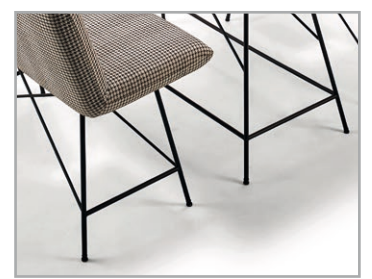
Filigree base frame, metal, powder-coated fine structure in black matt